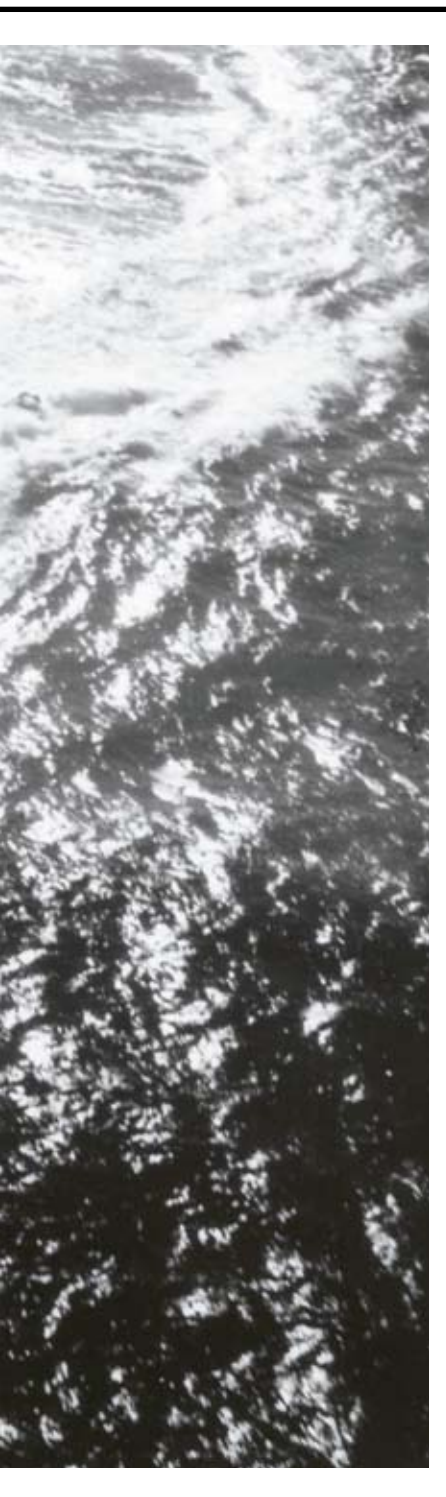
German U-Boat under allied attack.